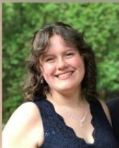
Lillian Moore Shelby High School