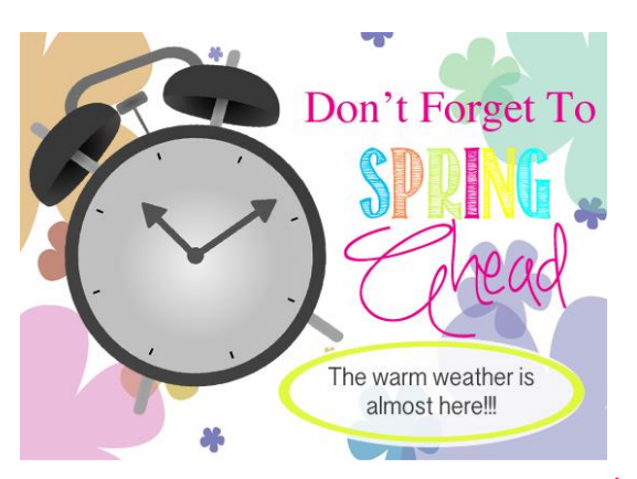
Daylight Saving Time Begins March 13<sup>th</sup>. Don't forget to spring ahead one hour. You don't want to be late for church